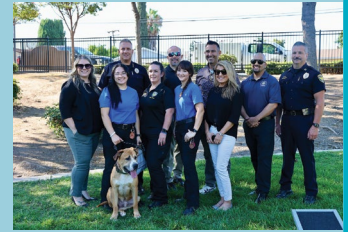
Manteca Animal Shelter (209) 456-8270