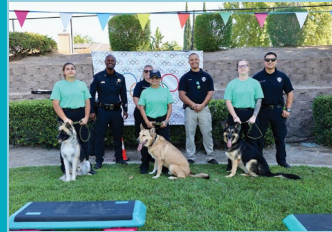
Lathrop Animal Center (209) 647-6480

The Paris Summer Olympics are over, but were you lucky enough to catch a glimpse of the First-Ever Animal Shelter Summer Olympics on the Lathrop Animal Center's Facebook page? Canine athletes from the Lathrop Animal Center, Manteca Animal Shelter, and the Tracy Animal Shelter rigorously trained for competition in three main events: obedience, agility and jumps. The Lathrop team earned a silver medal in obedience and gold medals in both Agility and jumps. All teams did an amazing job. If you are interested in adopting a furry athlete or lap dog, please contact: