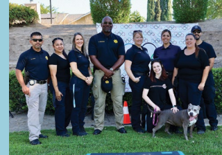
Tracy Animal Shelter (209) 831-6364