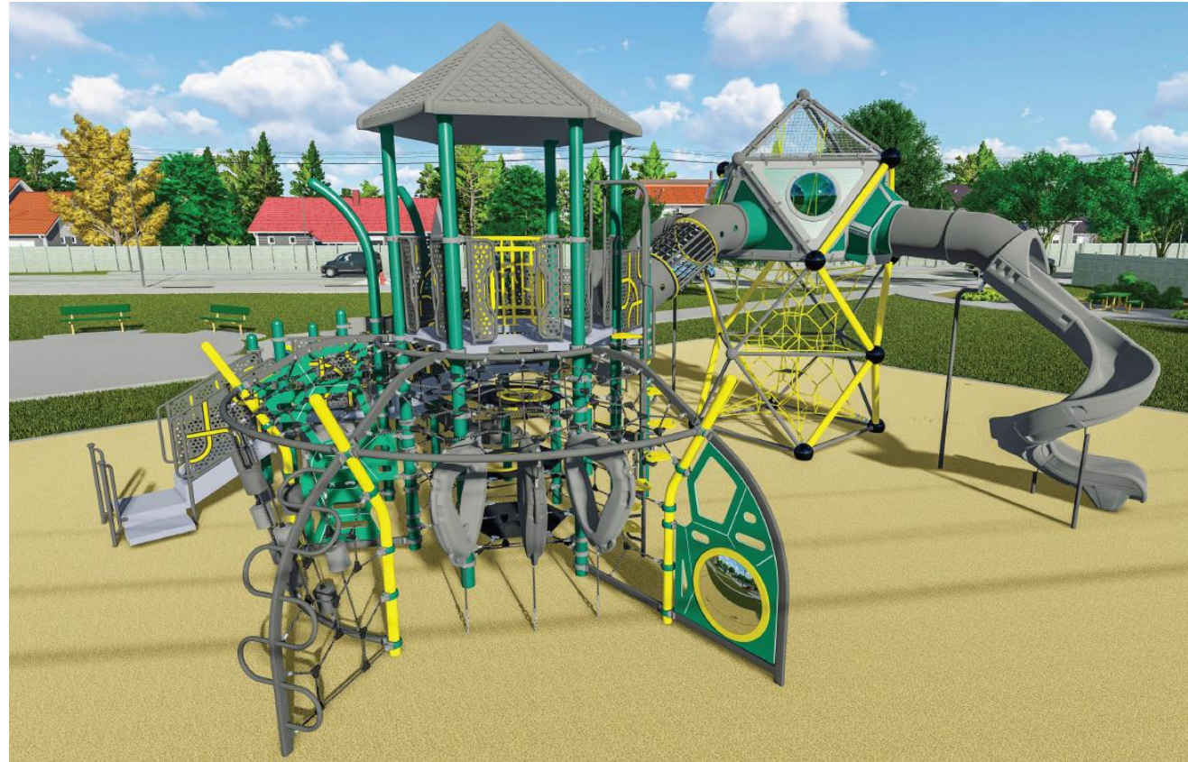
Option three of a playground structure with three slides and climbing elements throughout.