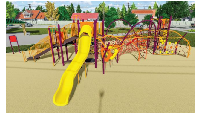
Option two of a playground structure.