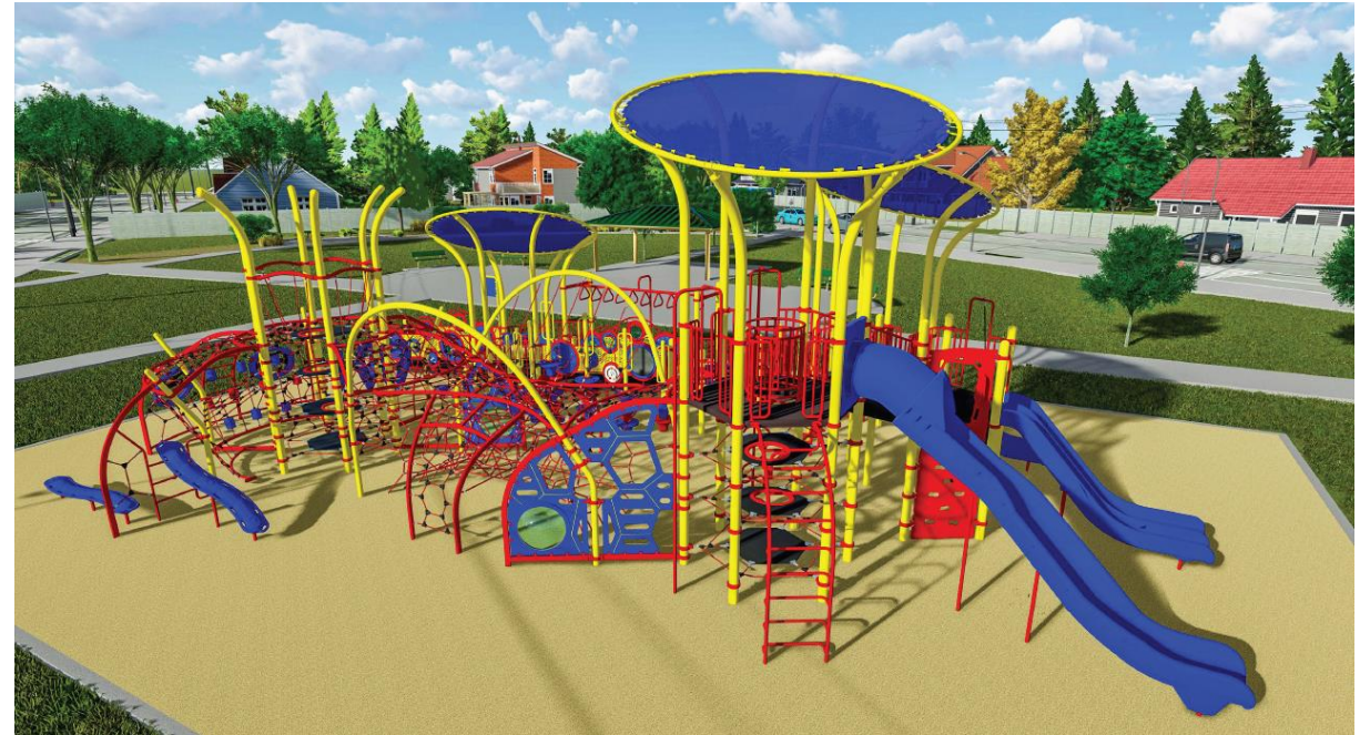
Option one of a playground structure with three slides, three shade coverings, and climbing elements throughout.

The option I is an extensive redesign of the existing one-acre park site including the installation of a children's play area with a material and installation total cost of $681,770.