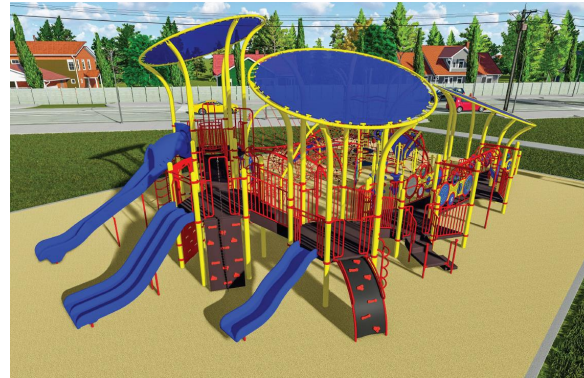
Option one of a playground structure.