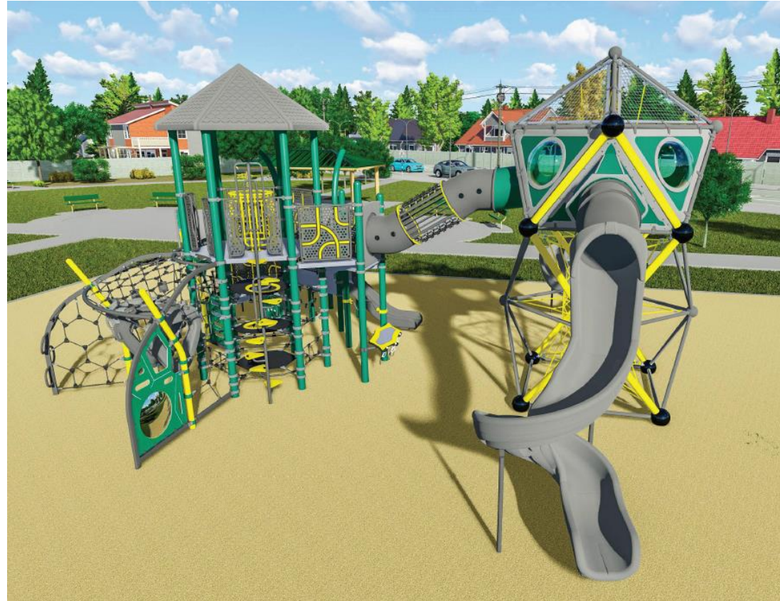
Option three of a playground structure with three slides and climbing elements throughout.

OPTION 3: Estimated material, delivery, and installation cost is $529,861.