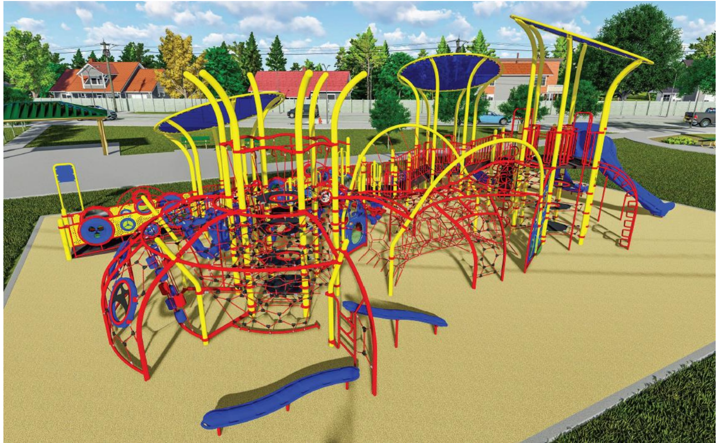
Option one of a playground structure with three slides, three shade coverings, and climbing elements throughout.

OPTION I: Estimated material, delivery, and installation cost is $681,770.