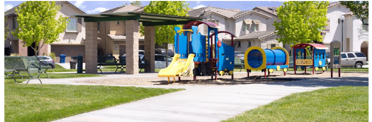
Blue and yellow playground structure with small slide and crawling tube with shade structure in background.