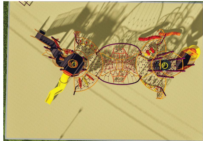
Overhead view of option two playground structure.