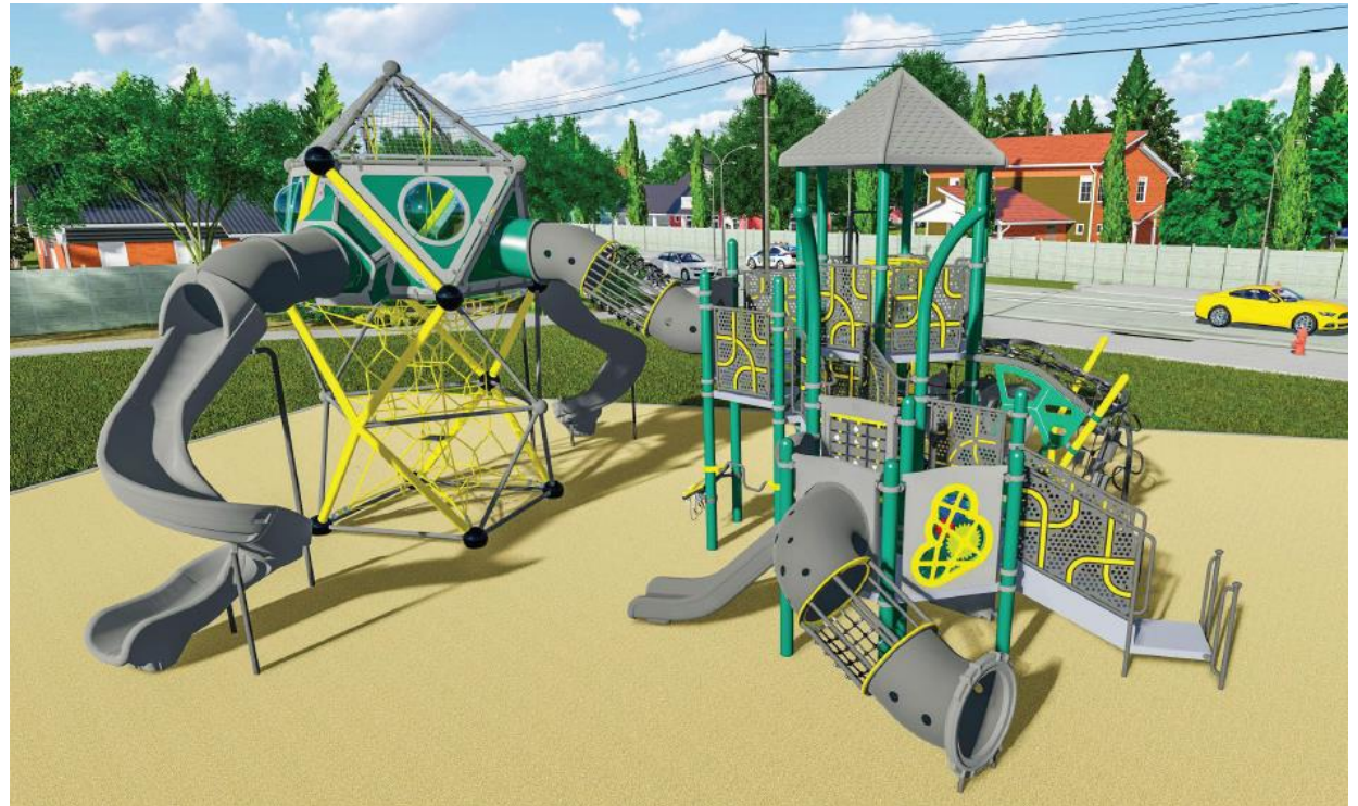
Option three of a playground structure with three slides and climbing elements throughout.

The option 3 is an extensive redesign of the existing one-acre park site including the installation of a children's play area with a material and installation total cost of $529,861.