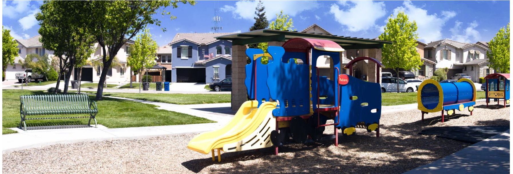
Blue and yellow playground structure with small slide and crawling tube with shade structure in background.