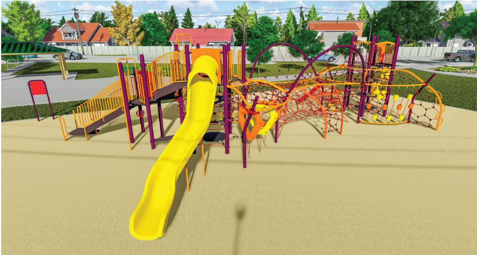
Option two of a playground structure with two slides and climbing and balancing elements throughout.