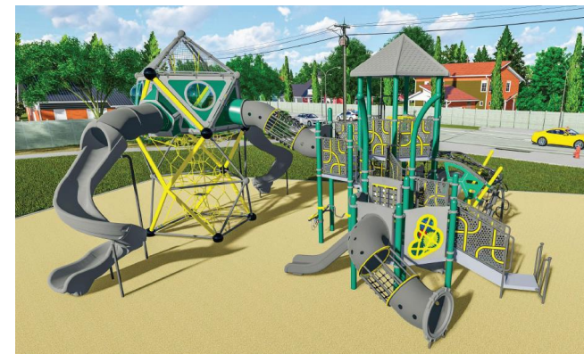
Option three of a playground structure.