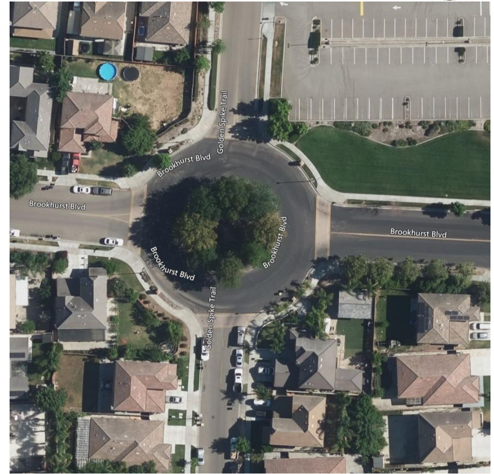
② Brookhurst Blvd and Golden Spike Trail