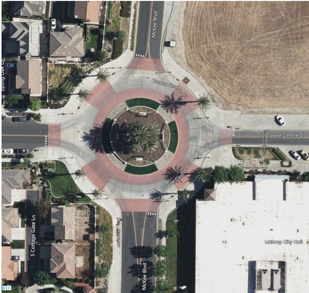
① Towne Centre Drive and McKee Blvd