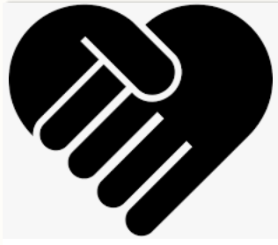
Public Services $13,942.80

Staff recommends that the City Council consider the information given at this public hearing and during the staff presentation to adopt a funding recommendation to allocated Fiscal Year 2021/22 CDBG and HOME program funds.