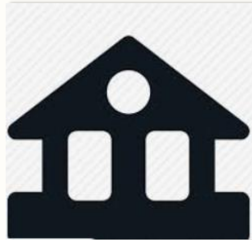
Public/Capital Facilities $79,009.20