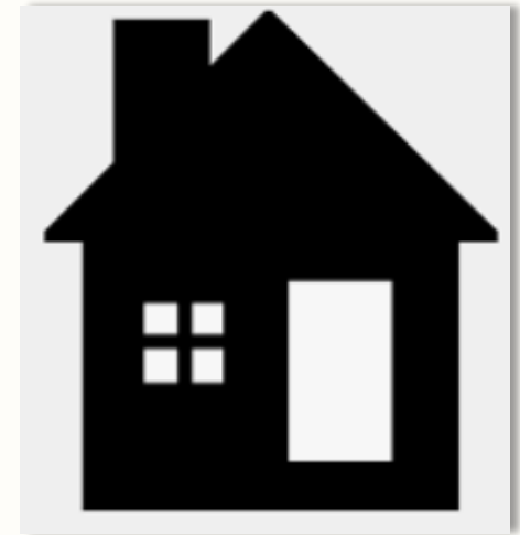
HOME Funds $30,506.00