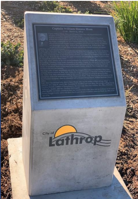
Leland and Jane Stanford Park