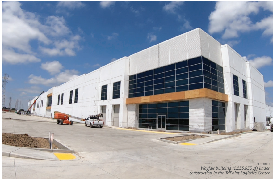
PICTURED Wayfair building (1,135,653 sf) under construction in the TriPoint Logistics Center